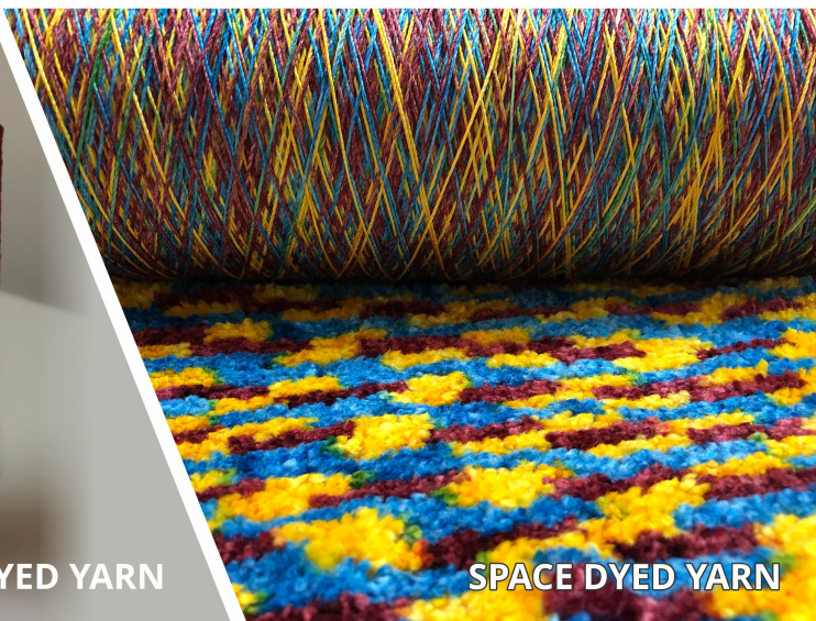
SPACE DYED YARN