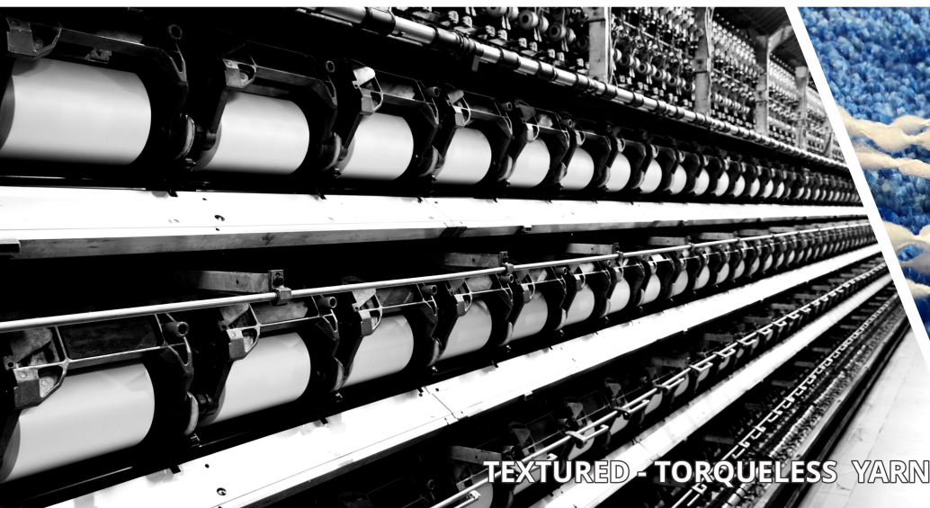
TEXTURED - TORQUELESS YARN